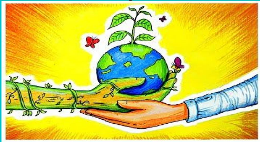
Chart Making Competition