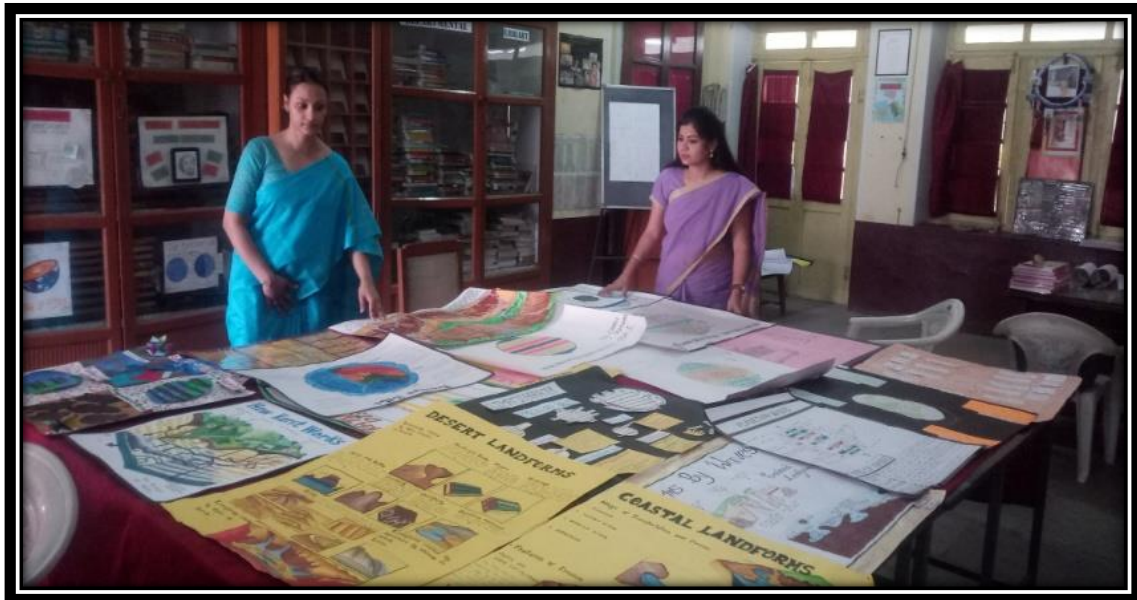
Chart Making Competition for the students of B.A./ Hons. Part I & III were organized by Department of Geography to highlight the creativity in them with different geographical perspectives to be described in the form of Charts.