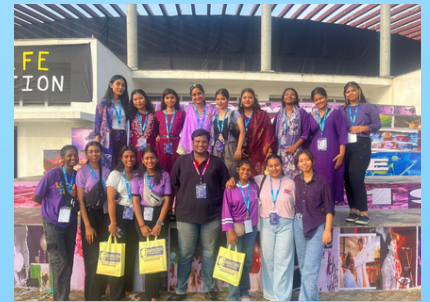
GOOD NEWS GROUP