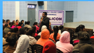
SILICON THE COMPUTER SCIENCE FORUM