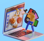
Basics of Graphic Designing