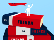
French (Level A1, A2, B1)