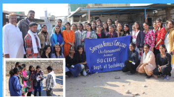
SOCIUS THE SOCIOLOGY FORUM