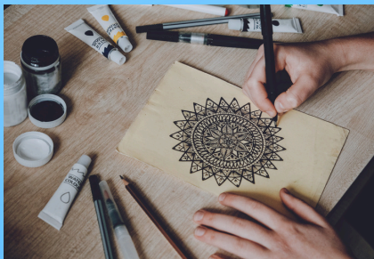
PICASSO THE ARTISTS' CLUB