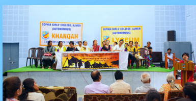
KHANQAH THE HISTORY FORUM