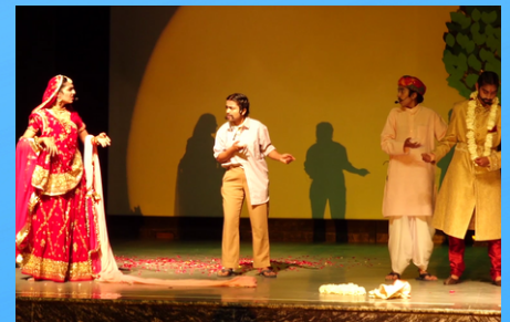
SPECTRUM THE DRAMATIC CLUB