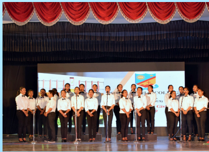
ANHAD THE MUSIC CLUB