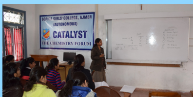
CATALYST THE CHEMISTRY FORUM