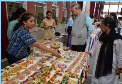
INNOVATIONS- THE ENTREPRENEURS' CLUB