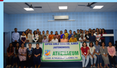
ATHENAEUM THE ENGLISH FORUM