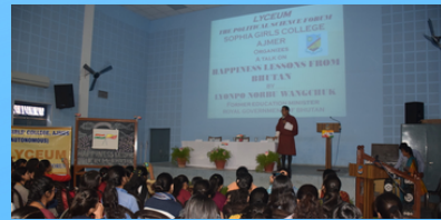
LYCEUM THE POLITICAL SCIENCE FORUM