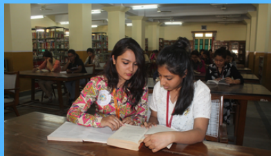
RANGANATHAN THE LIBRARY AND INFORMATION SCIENCE FORUM