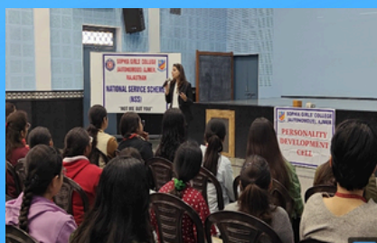
THE WOMEN'S DEVELOPMENT CELL