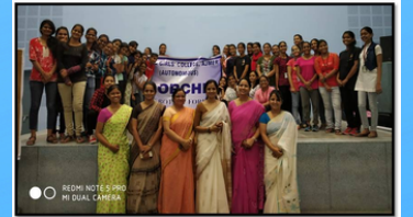
ORCHID THE BOTANY FORUM