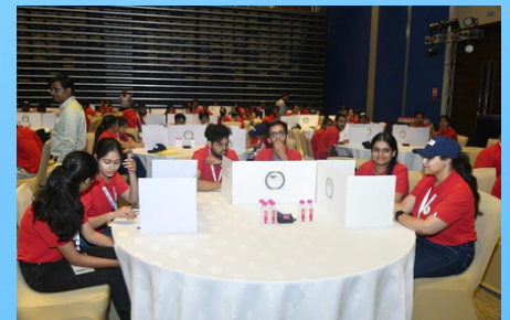
PAHELI THE QUIZZERS' CLUB