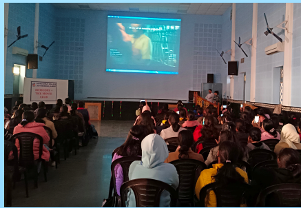
BIOSCOPE THE MOVIE CLUB