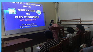
PRAKRITI THE GEOGRAPHY FORUM