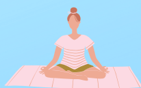
Basics of Yoga