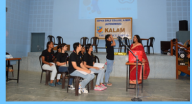
KALAM THE PHYSICS & MATHS FORUM