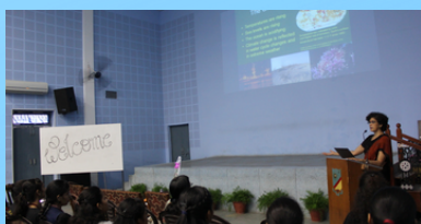
FLORICAN THE ZOOLOGY FORUM