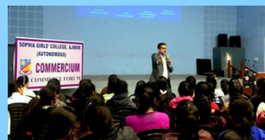
COMMERCIUM THE COMMERCE FORUM