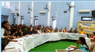
ARTH-NITI THE ECONOMICS FORUM