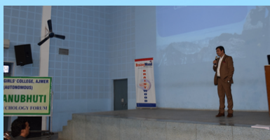
ANUBHUTI THE PSYCHOLOGY FORUM