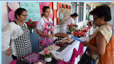
AASHIYA: THE HOME SCIENCE FORUM