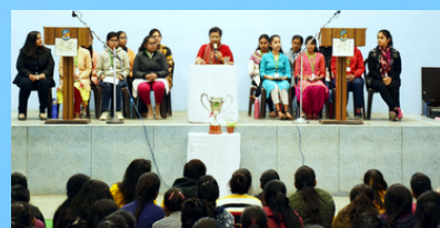
GYANODAYA THE HINDI FORUM