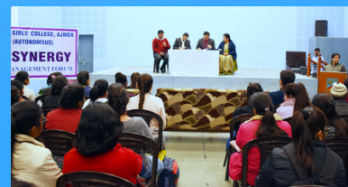
SYNERGY THE MANAGEMENT FORUM