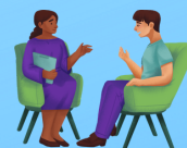
Basics of Counselling Skills